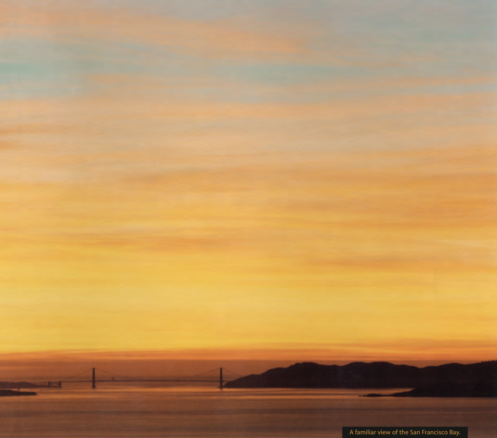
A familiar view of the San Francisco Bay.