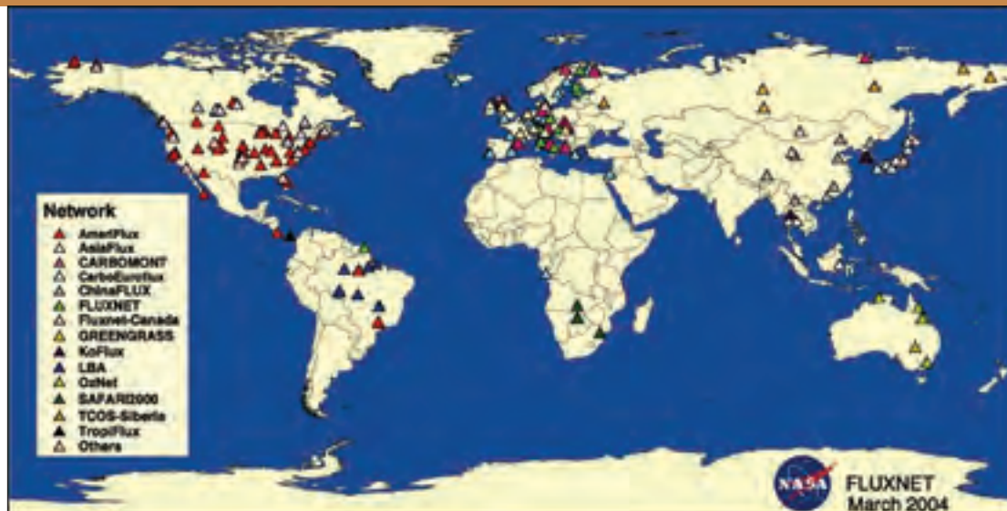
The FLUXNET system of climate data collection stations incorporates over 15 previously existing regional collection networks into one global network. Researchers have access to information from over 200 stations worldwide.

However, as GDP rises, total greenhouse emissions will still increase by 12% under this plan. Thus, Fung suggests that Bush’s plan “is not the right approach. The source of the problem is the emissions,” and these will continue to rise. Additionally, because all reporting of greenhouse gas emissions is voluntary under the current policy, there is no independent verification of the data that industry reports to the government. Policy decisions aside, the bottom line is that global climate change can be